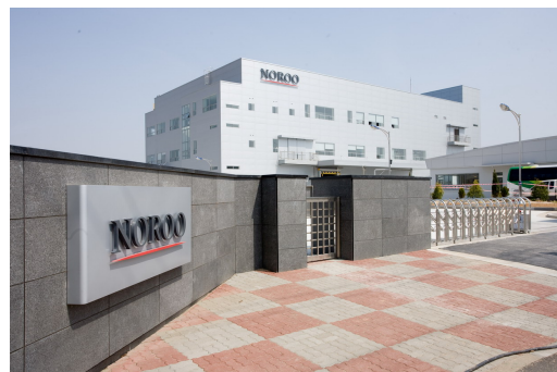
< State-of-the-art Poseung Auto-Refinishes Factory >